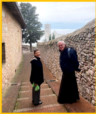
On the way to the Basilica of St. Francis of Assisi