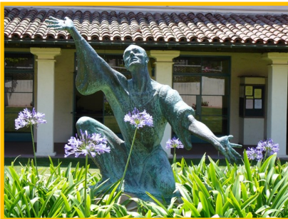
Santa Barbara statue of Francis' Stigmata

"I love this depiction of Francis' utter joy and gratitude, because in the stigmata God confirmed for him he had done all that God asked of him."