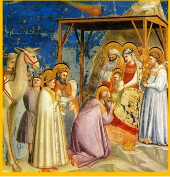
Adoration of the Magi -Giotto

"We become what we love and who we love shapes what we become..."