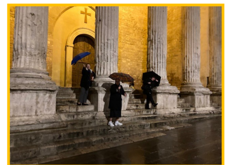
A rainy night outside the Church of Santa Maria Sopra Minerva in Assisi

A Message from Pope Francis. On October 18 in his daily message he said, "We take everything for granted: our faith and our relationship with God. Gratitude makes us appreciate the presence in our lives of the God who is Love...So please, let us not forget to say these key words: Thank You!"