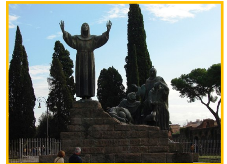
Francis before St. John Lateran "I like to think these arms are lifted up not just to support John Lateran, but to say, Thank You, God!"

Chapter 23 of the Earlier Rule of St. Francis , entitled "Prayer and Thanksgiving," is filled with Gratitude: "We thank you for Yourself" [how often do we thank God for just being God?]; "Through your Son you created us and loved us;" "Your Son Himself will come again;" and "for the Holy Spirit." This chapter is a must read during the New Year.