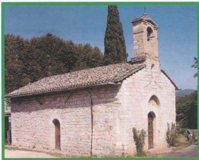
Chapel of La Maddalena: Leper Colony where Francis ministered to lepers.