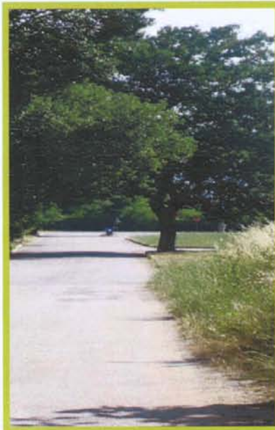
The road on which Francis met a leper.

The embrace of the leper was a major uncovering moment in Francis's conversion journey. In that encounter something shifted radically inside his heart and transformed his vision of reality. This was the turning