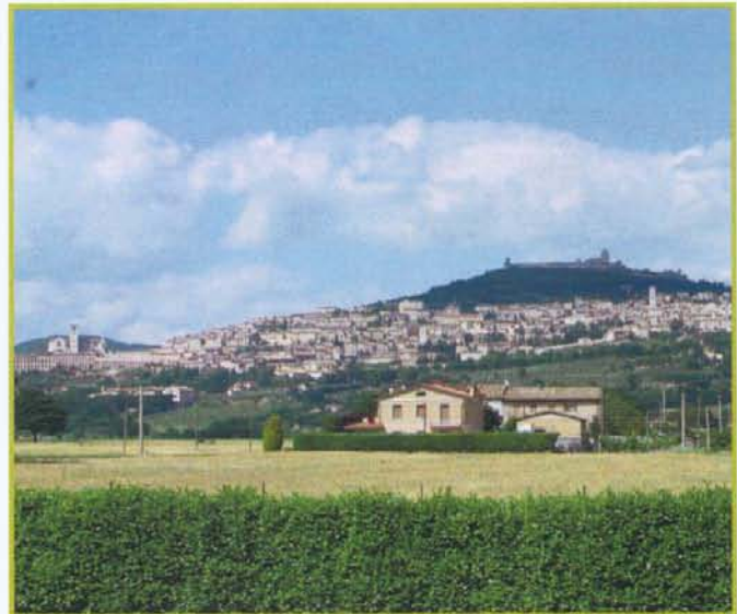
View of Assisi from leper colony. Lepers could never return to their home town.

The poor and the outcast make us face up to the gospel whether we like it or not. We confront this truth over and over, wherever we encounter them, and in our daily decisions on how we will respond to those in need, anywhere in the world. It does put living flesh on the Secular Franciscan Rule: