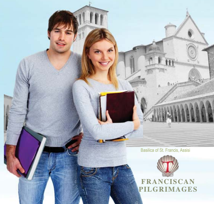
Basilica of St. Francis, Assisi

P.O. Box 321490 • Franklin, Wisconsin 53132 414.427.0570 • 414.427.0590 fax