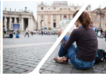
St. Peter's Square, Rome