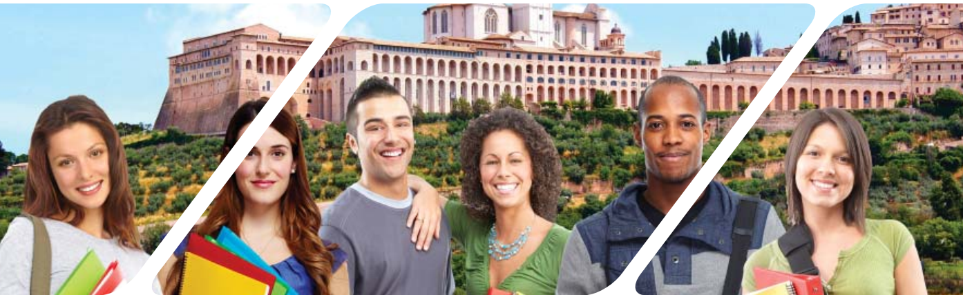
College pilgrims with Basilica of St. Francis in the background, Assisi