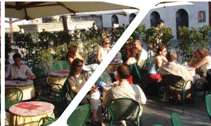
A "bar", Assisi