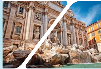
Trevi Fountain, Rome